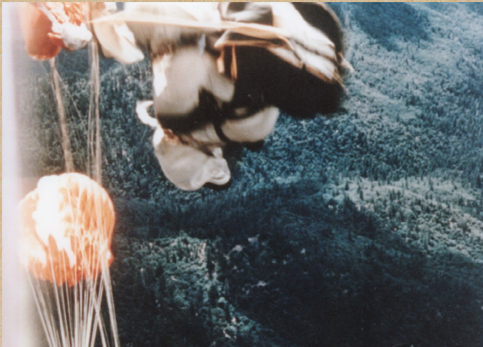
"Jumpers Away" California Smokejumpers 1969

We will miss the VAC and our LVNP and LPF friends.