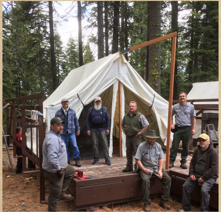
VAC Tents Go Up NSA & Lassen "Engine Room"

NSA came on to the scene in 2017 to help with the very busy "Spring Rush" as our Lassen Maintenance friends (we nicknamed "the Engine Room") open roads, campgrounds, water systems, and get the VAC up-and-running. More than a dozen former smokejumper volunteers were "handed the keys" to construct the Osprey campfire area, cut & install pathway sill logs, and lay down 48 cubic yards of delivered aggregate to pathways and campfire areas, assemble the new picnic tables, then the tents and cots.